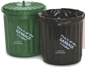
Your new mini bin

Use your Mini Bin to carry waste from your office to your kitchenette where you can sort waste into the containers. Please note - cleaners will not empty mini bins!